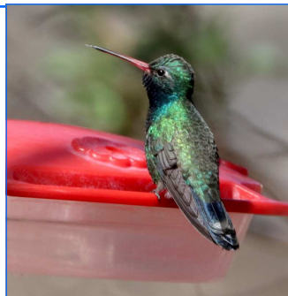
Broad-billed hummingbird