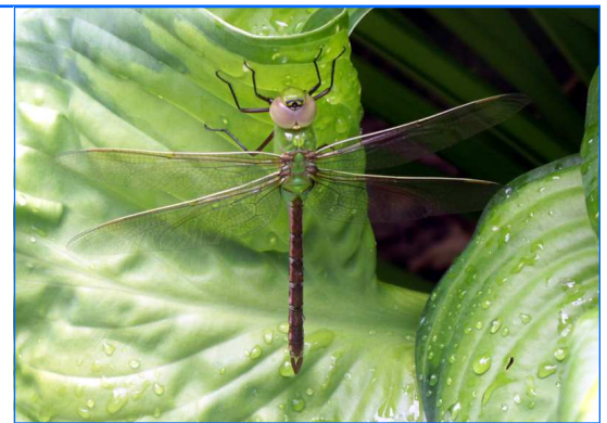
Shrink your lawn and you never know what might show up!

Native plants, however, succeed at achieving these four goals! We can help our yards become healthy, productive, and purposeful by planting the plants that are good at supporting pollinators, good at capturing energy and sharing it with our local wildlife, and good at holding carbon,