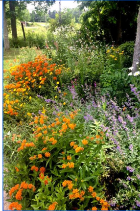
A native plants garden is lush and colorful.

conservationist and professor in the Department of Entomology and Wildlife Ecology at the University of Delaware, there are four functions or goals that every homeowner’s landscape and yard must perform to produce a healthy and viable ecosystem that we all need: