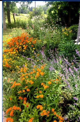
A native plants garden is lush and colorful.

gist, conservationist and professor in the Department of Entomology and Wildlife Ecology at the University of Delaware, there are four functions or goals that every homeowner’s landscape and yard must perform to produce a healthy and viable ecosystem that we all need: