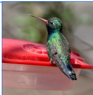
Broad-billed hummingbird