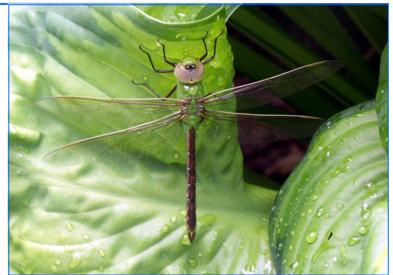
Shrink your lawn and you never know what might show up!

Native plants, however, succeed at achieving these four goals! We can help our yards become healthy, productive, and purposeful by planting the plants that are good at supporting pollinators, good at capturing energy and sharing it with our local wildlife, and good at holding carbon,