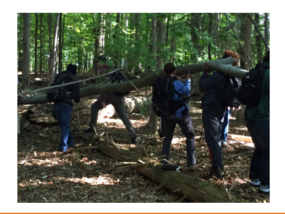
WRLC Hosted Hike at Hach-Otis May 19, 2017