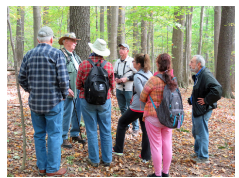
Fall Color Walk at Hach-Otis - October 21, 2017